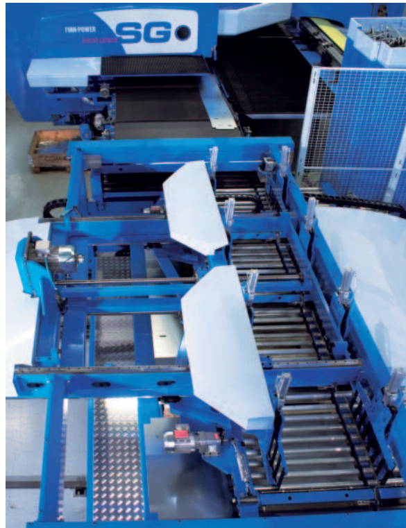
The fast component flow from integrated right angle shearing can be flexibly automated

processing cost, including set-up change times, simplicity and speed of programming, eventual chances of savings through better raw material utilization, etc. Within just three years the machine tool manufacturer Finn-Power, Kauhava/Finland ( www.finn-power.com ) and among others its sales subsidiary in Hallbergmoos/Germany ( www.finn-power.de ) have introduced new automation levels, new product solutions, and a new generation of practically into every machine type in the wide range. Along with improved performance values and higher productivity comes a totally new industrial design. Relying on its modular engineering tradition, the company now introduces several optional features that allow better customization of technology to meet application-specific requirements. The company has been adding indexable upforming to its punching and integrated punching/shearing and punching/laser cutting technology since 2003. A new solution, recently introduced at the Metapro exhibition